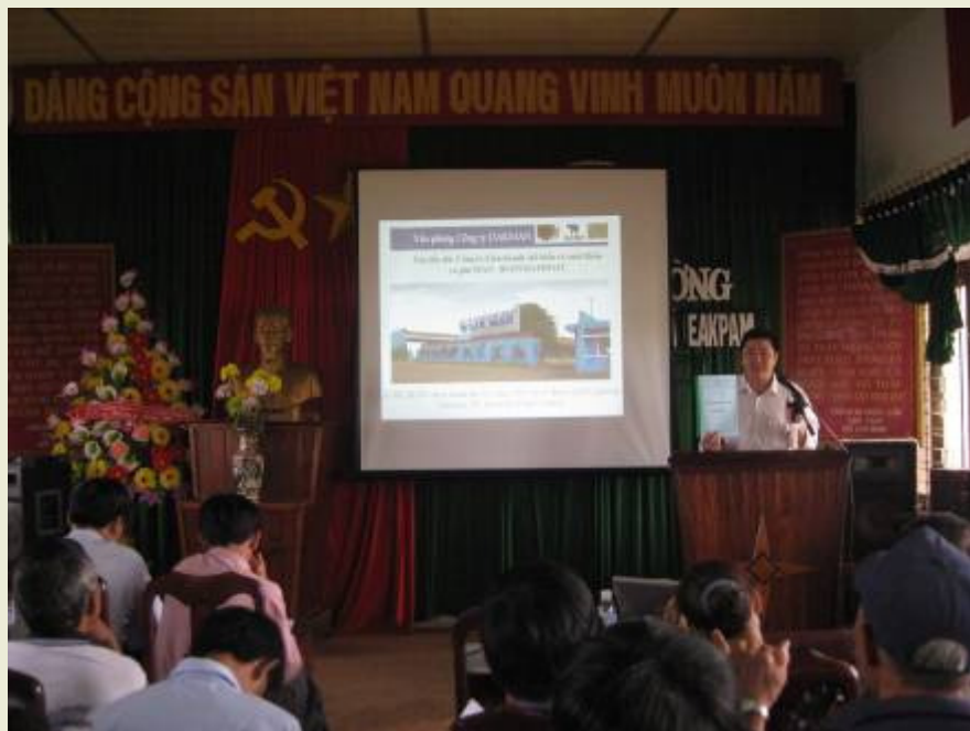
A variety of tools and materials are used during the training sessions.

Images of what and what not to do are highly effective. Not all farmers are widely literate and some, from ethnic groups, use different language and dialects making anterior methods of communication and teaching essential.