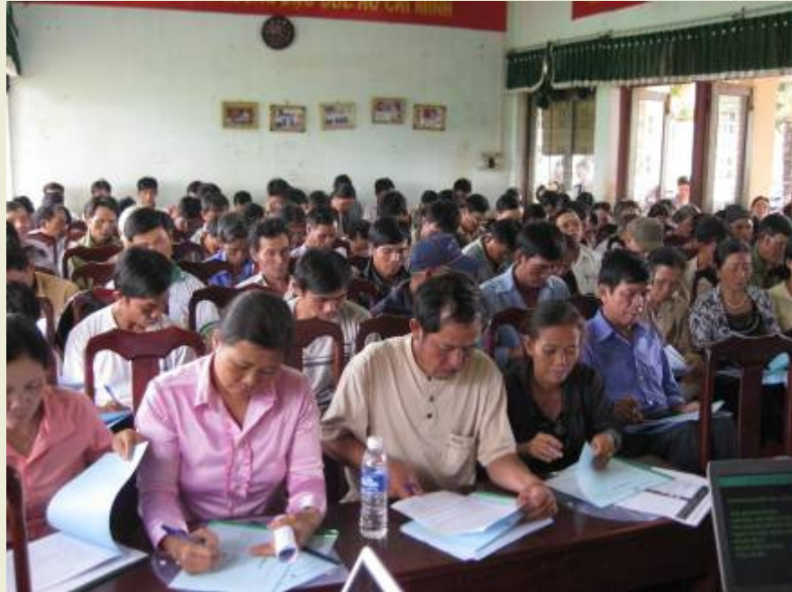
Farmers work hard to complete their training.